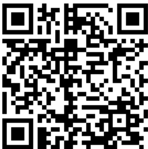
CHART is run by Centre for Environment, Fisheries and Aquaculture Science ( www.cefas.co.uk ) and funded by the Department for Environment, Food & Rural Affairs ( Defra ).

You can access the survey by scanning the QR code below or at the following link: https://defragroup.eu.qualtrics.com/jfe/form/SV_4SdDYdBG7SwuTWu .